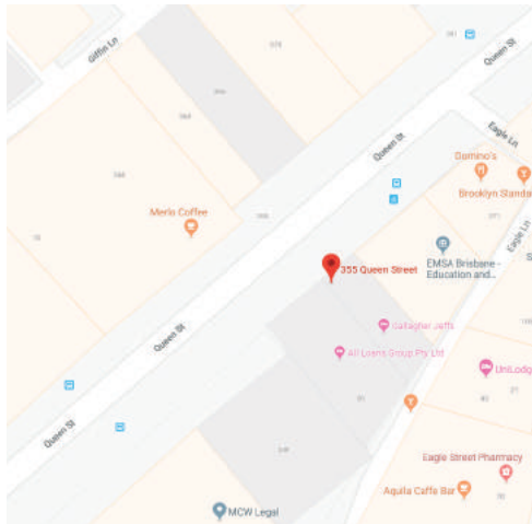
Mortgage Choice in Brisbane City 355 Queen Street, Brisbane City 4000

With multiple office locations and mobile brokers servicing the Brisbane area, we are able to meet with our clients anytime, anywhere. Our online booking functionality allows our clients to arrange an appointment at a time and place of their choosing whether that be in-office, at home, your workplace or local café.