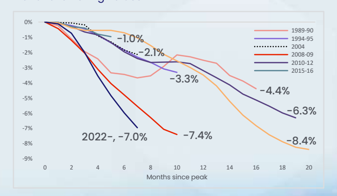
Figure 2 - Comparison of previous peak to trough decline in national dwelling values

Since the first interest rate rise, national dwelling values have fallen by -7.0%, overtaking the 2008-09 downturn as the steepest national decline on record. This is the equivalent of a fall in the median dwelling value of approximately $53,500, to $714,475. While this has helped shift negotiating power back to the buyer and may have helped some first-home buyers get over the deposit hurdle, the significant rise in interest rates has seen the conversation around affordability shift from accessibility towards serviceability.