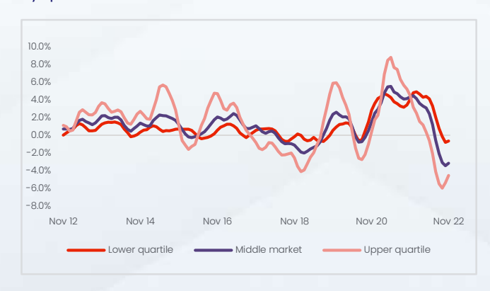
Figure 3 – Quarterly change in National dwelling values – by quartile

Notably, the quarterly growth chart of tiered hedonic indices (above) also shows a faster shrinking in the rate of decline across the top 25% of home values in the past few months. The top 25% of Australian home values declined -6.0% in the three months to September, followed by a softer rate of decline of -4.5% in the three months to November. This deceleration in the rate of decline is also becoming evident across the middle and low end of the market.