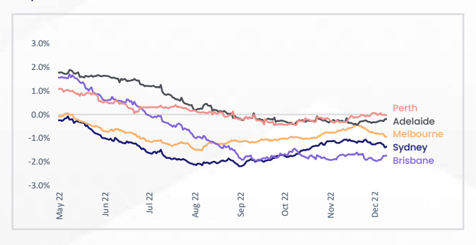
Rolling 28 day change in daily home value index, major capitals

Another downside risk for the pace of decline could be the end of fixed rate terms in 2023. When average fixed-interest rates reported by the RBA bottomed out at 1.95% in May 2021, the portion of fixed-interest mortgages grew from around 15% in the six months preceding COVID to more than 40% between April and November 2021. According to loan analysis by the RBA in the August Financial Stability Review, around 66% of fixed-term housing lending terms are set to expire by the end of 2023. A non-inconsequential number of homeowners could see a high 'sticker shock' as they move from fixed rates in the low two or sub-two per cent range, to a variable rate environment where average lending rates are between five and six per cent. If this leads to more motivated selling, additional supply could place further downward pressure on prices.